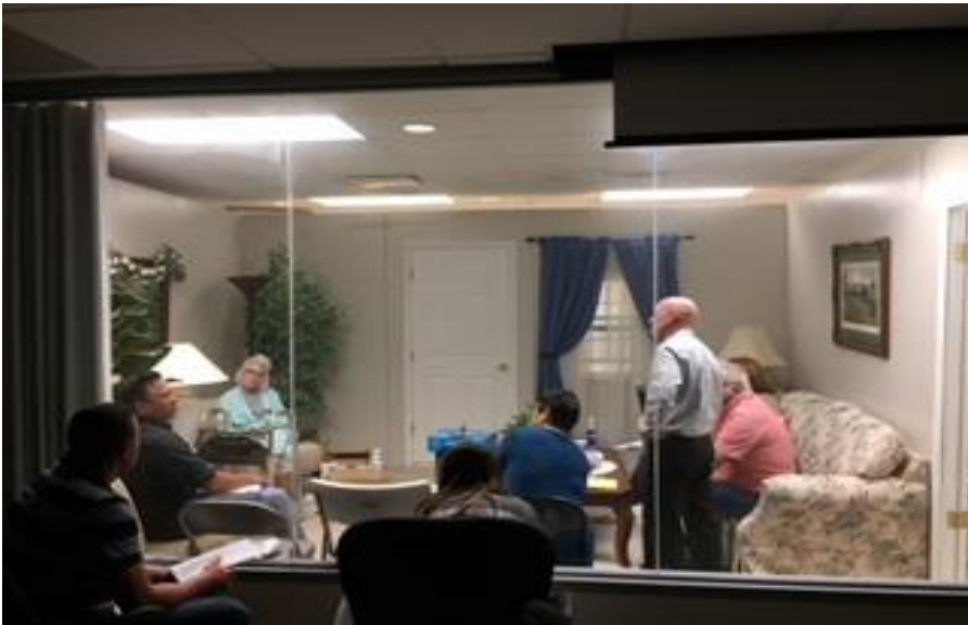
Orange County Sheriff's Department Coroner's Office Training Rooms